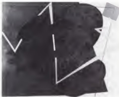
Elizabeth Murray, Chair in Memory , 1978

about both simplification and detail. Chance, indeterminacy, and variable installation also became regular features of Post-Minimalist art and foils for reductive form—as observable in the wrinkled surface of Richard Tuttle's eccentrically shaped cloth piece, the languid and non-replicable repose of Morris' gridded hanging felt, George Rickey's wind-sensitive eighteen-foot verticals, and the ambient interactions of parts in Sonnier's glass and neon construction. Vito Acconci's False Center for L.A. conjoins Minimalism and theater; his quartet of simplified, elongated chair forms is accompanied by a taped monologue by the artist, who was formerly a poet. In the paintings of Al Held and, later, Elizabeth Murray, a complicated baroque geometry prevails. Held explores elaborate spatial interplay on a two-dimensional, slick-surface canvas ground. On mottled, single-tone fields of paint, Murray uses shape and line as actors in coded, personal dramas. Nowhere was the Post-Minimalist transition as potent as in Frank Stella's paintings, from Sanbornville III to Silverstone , the swing from logic to intuition, from reductive to additive, from hands-off to hands-on, is